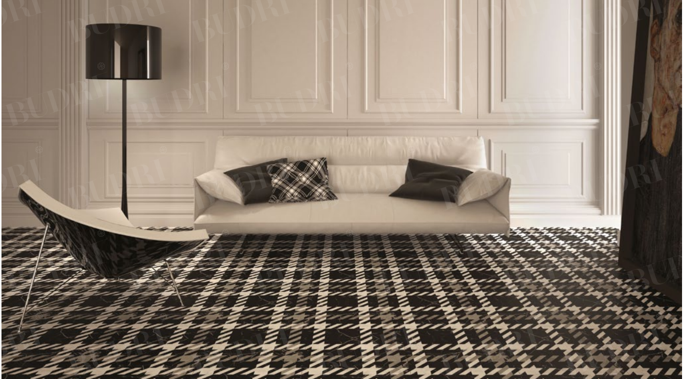
GLASGOW O2 FLOOR INLAY