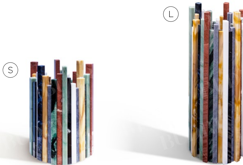
WANDO VASE S